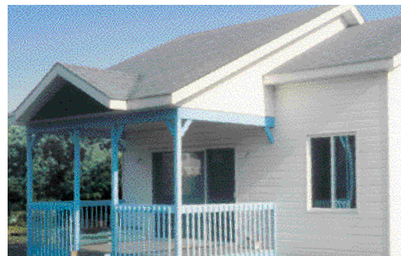
Bungalow with all comforts.