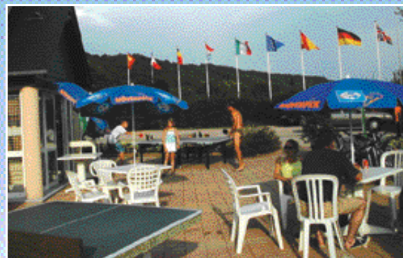
Campsite reception area.