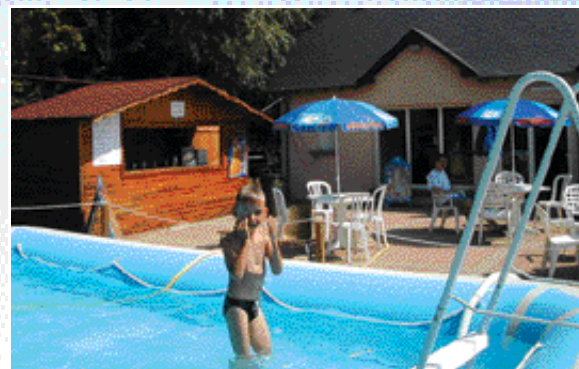
Paddling-pool and terrace.